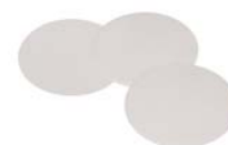
Polypropylene Membrane Filters