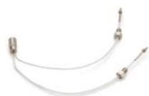
Mixing Capillary Assembly