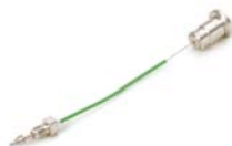
Needle Seat Assembly