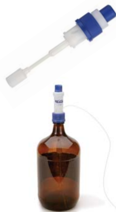
Hub-Cap Adapter and Opti-Cap®