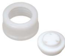
Hub-Cap (assembly of the bottle cap and plug)