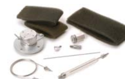
Preventative Maintenance Kit for 717 Autosampler