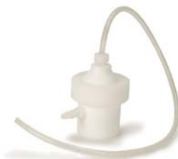
Hub-Cap Filter Kit

Transfer and filter mobile phase in a single step!