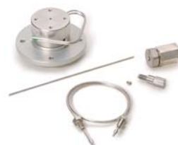
717 Seal Pack (Rebuilt) with Needle