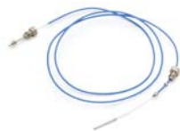
Capillary SS Tubing with fittings